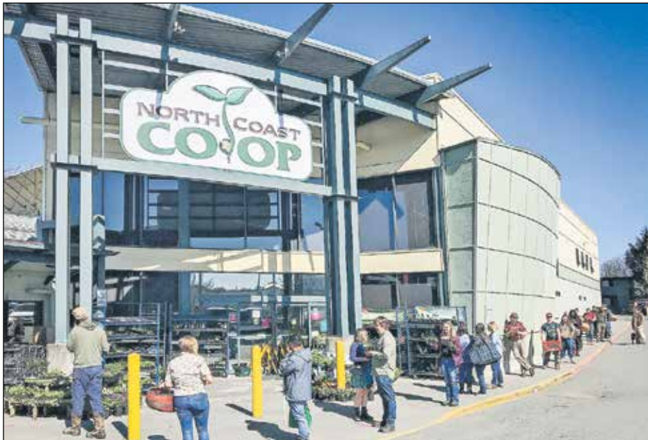
CO-OPERATIVE QUEUE — Customers line up and keep their distance as they wait to enter the North Coast Co-op in Arcata, part of the store's efforts to limit crowding during the coronavirus crisis.