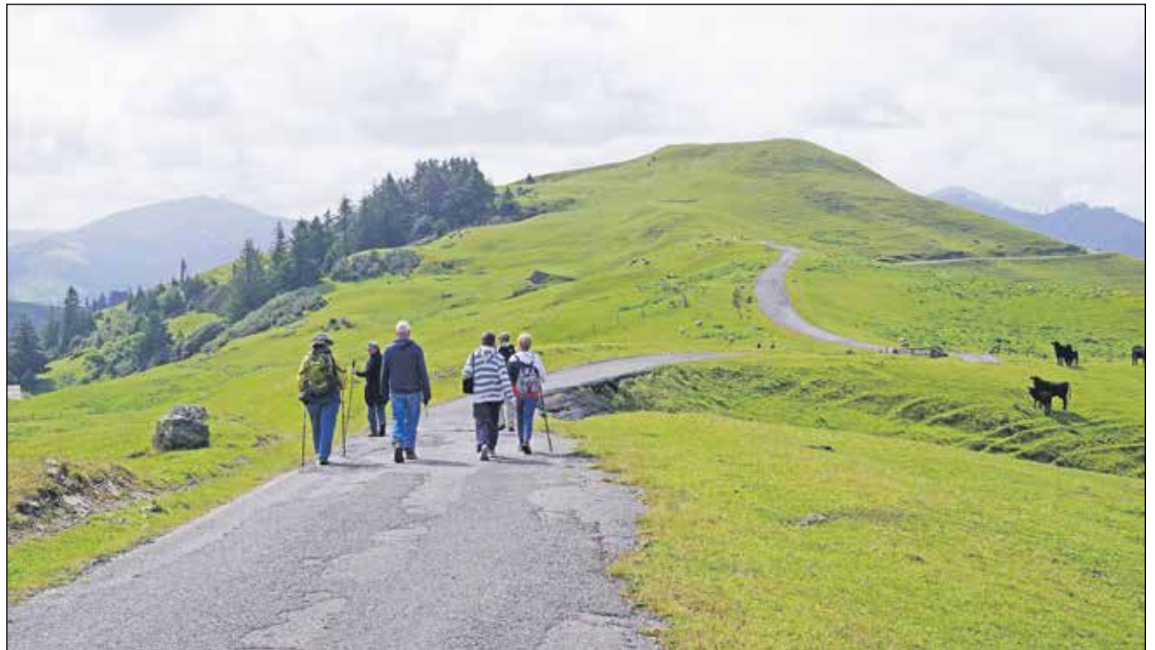
WORTH THE WALK — Spectacular views abound from Bear River Ridge Road near the intersection of Bear River Road.