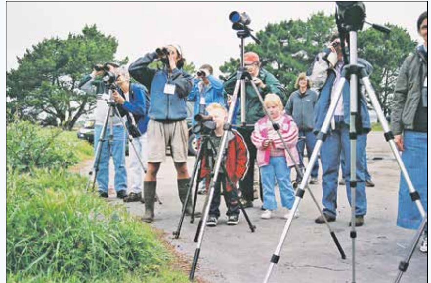
Birding on the Arcata Marsh.

Neither rain nor snow nor coronavirus can keep Humboldt County’s birds from their annual spring migrations, so a trip to the shore, to the South Bay or to the Arcata Marsh is still a good outdoor option, even during a pandemic.