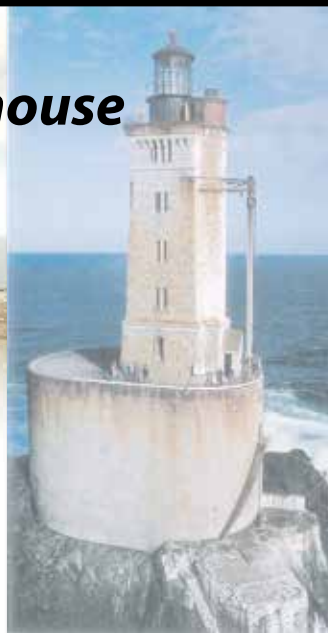
Six miles offshore from Crescent City

Call 707-442-4117 to make your reservation