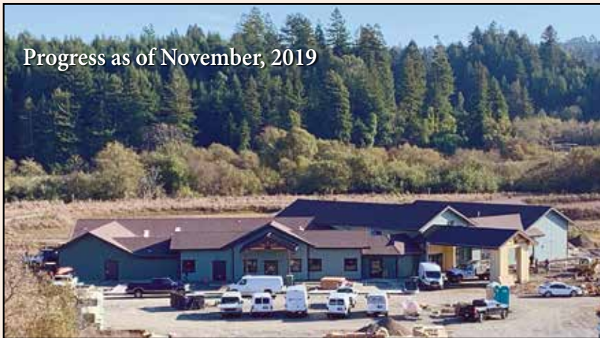
Progress as of November, 2019