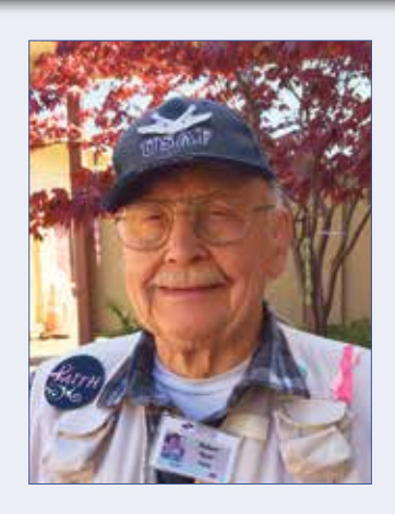
"I look forward to each new day"

Senior News is the only community periodical on the North Coast targeted to those age 50 and better. Senior News distributes 13,000 free copies per month throughout Humboldt County and is online at www.humsenior. org. During FY 2017-18, Senior News published stories from more than 75 local writers and organizations, and was supported by advertising from 72 different businesses and nonprofits.